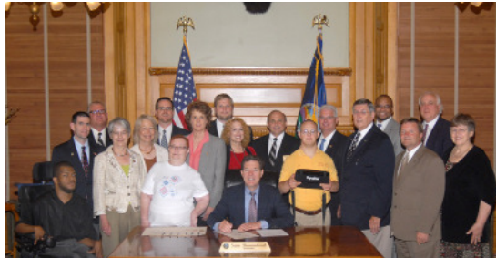
DRC staff, disability advocates, and legislators at a bill signing with Governor Brownback.

DRC obtains justice for people with disabilities. We are interested in the broad spectrum of disability rights issues including – abuse & neglect, public accommodations, employment, Medicaid, Home and Community Based Waiver services, and Vocational Rehabilitation. DRC fights for justice through negotiation, client advocacy, administrative hearings, court action, self-advocacy support and technical information assistance and referral. DRC's public policy advocacy efforts educate legislators, states government policymakers, the press and the public to promote disability rights in Kansas. Finally, DRC promotes outreach activities and training in order to educate people with disabilities about their rights.